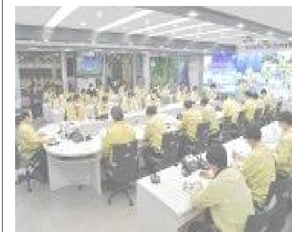
▲[Feb.21] Emergency response meeting among relevant institutions to deal with the first confirmed case in Busan