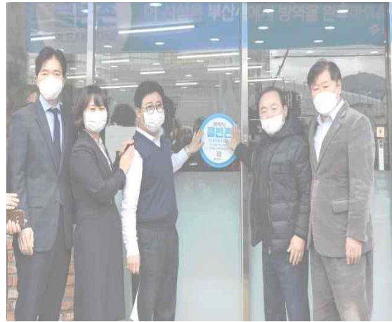
▲[Mar.3] Clean Zone designation (Dongnae Milmyeon)