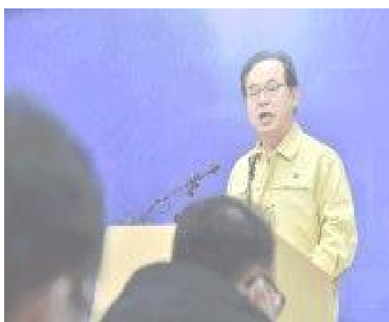
▲[Feb.22] Press briefing after appearance of first confirmed case