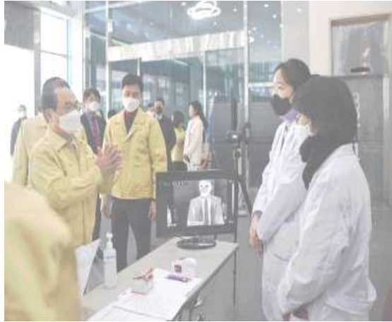
▲ [Feb.7] Visit to BEXCO for site check of COVID-19 response process