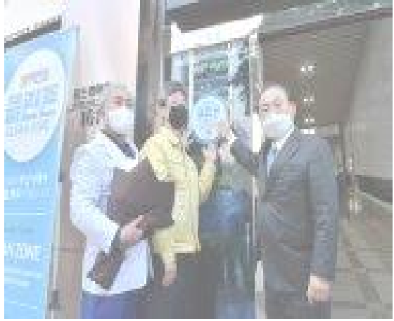
▲ [Mar.17] Asiad nursing hospital, released from cohort isolation