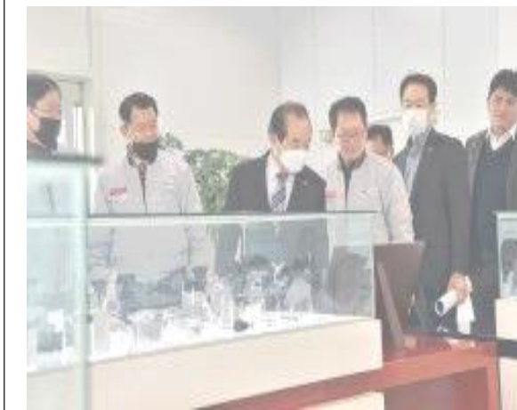
▲[Feb.19] Visit to affected businesses of COVID-19 fallout