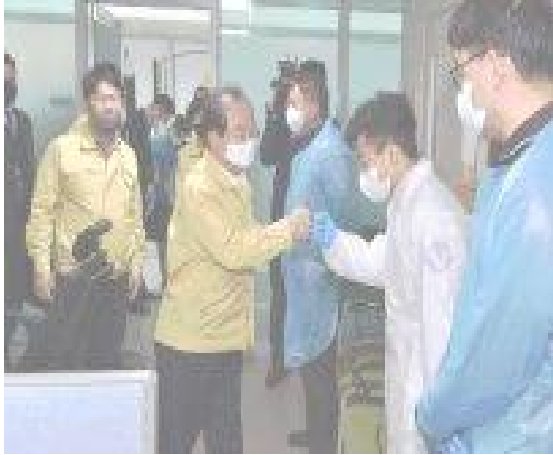
▲ [Mar.19.] Visit to temporary isolation facility at the Busan Human Resource Development Center