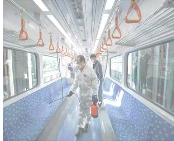
▲ [Feb.13] Site check of Nopo vehicle management office & disinfection work