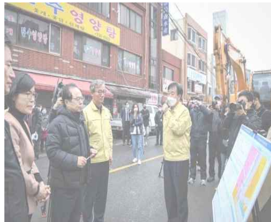
▲[Mar.10] Given field briefing of Renewal Project of Gupo market