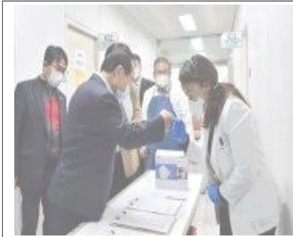
▲ [Jan.28] Visit to Busan Metropolitan City Medical Center responding to COVID-19