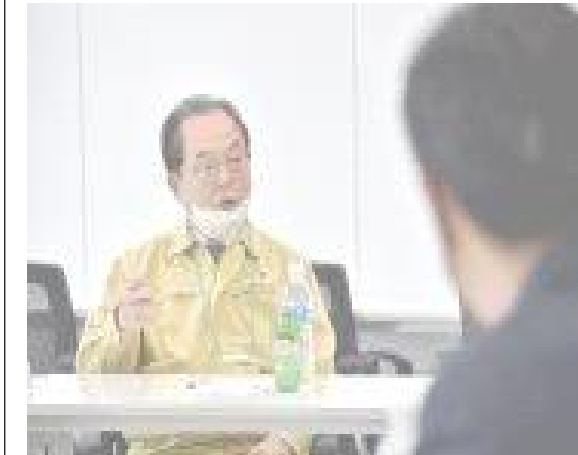
▲ [Mar.11] Site visit to contact center in Seomyeon