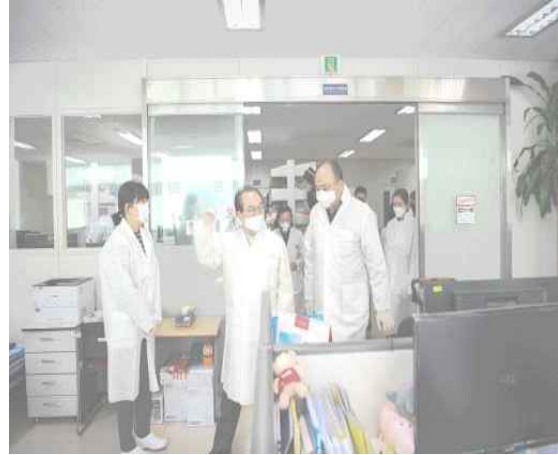
▲ [Mar.20.] Visit to Public Health and Environment Research Institute to check on-site response status