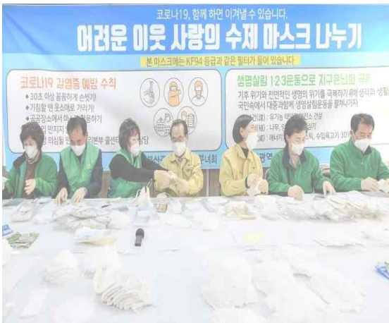
▲[Mar.5] Visit to handmade face mask production shop to give encouragement to volunteers