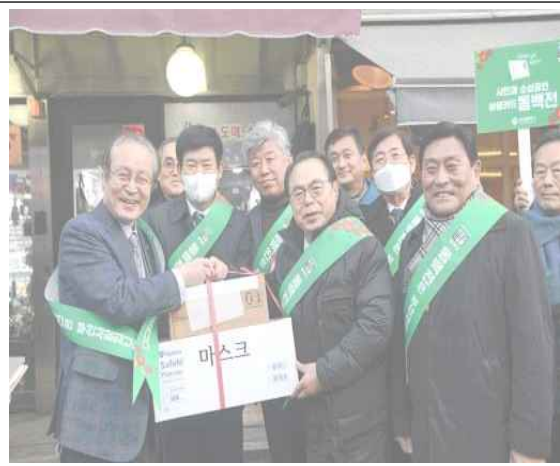
▲ [Feb.4] Delivery of disinfectant items and gathering of opinions at Gukje Market