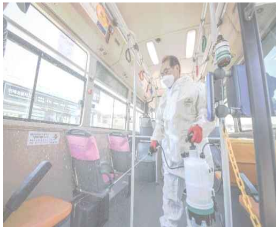
▲ [Feb.13] Site check of public bus garage & disinfection work