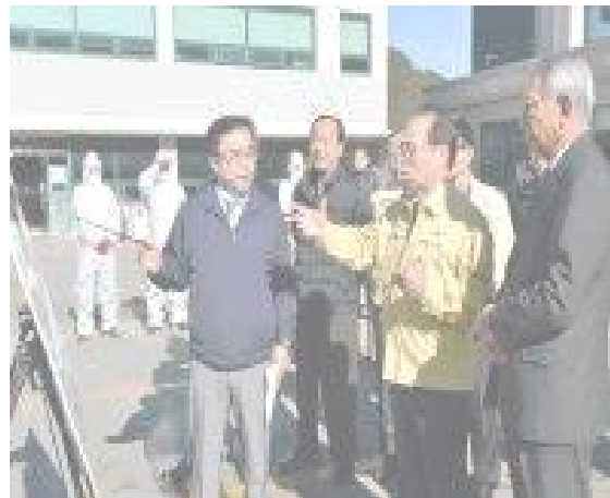
▲ Visit to Private Taxi Association to check on-site response status