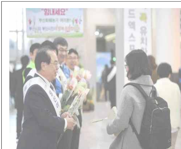
▲[Feb.14] Organized a flower market to support affected flower growers