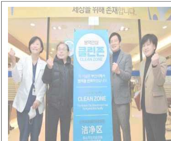
▲ [Mar.11] Haeundae Sharing and Happiness Hospital, released from cohort isolation