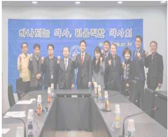
▲ [Mar.17] Visit to Busan Pharmaceutical Association to encourage public face mask sales