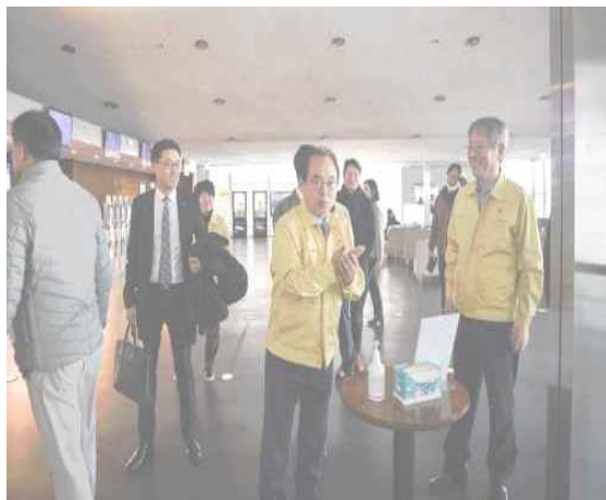
▲[Feb.18] Visit Busan Cinema Center to check on-site response status