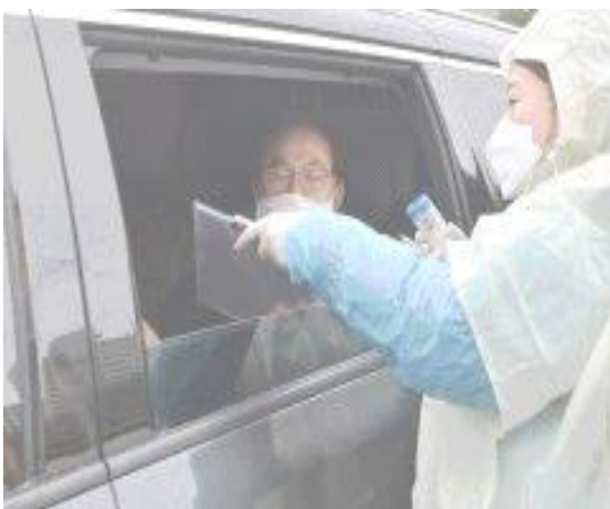
▲[Mar.10] Visit to drive-through screening clinic in Buk-gu