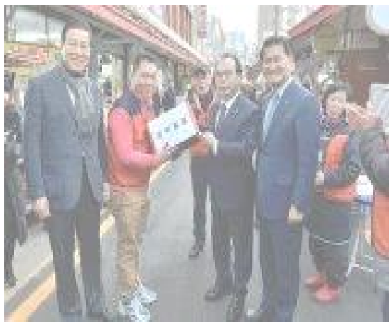
▲[Feb.20] Sujeong Market - Delivery of disinfectant items & gathering of opinions from merchants