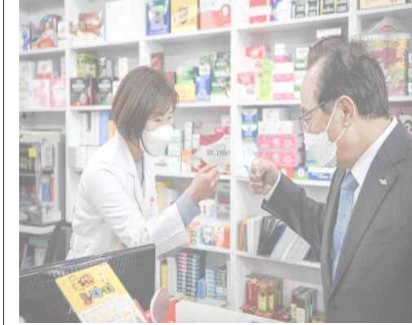
▲ [Mar.17] Surprise visit to designated pharmacies selling public face masks