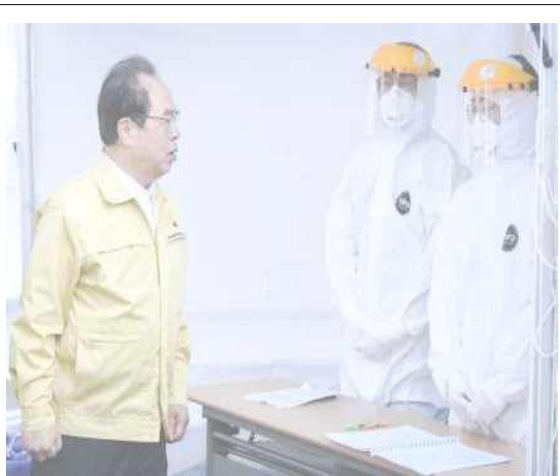
▲ [Mar.11] Visit to drive-through screening clinic in Jin-gu