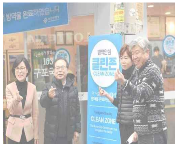
▲Clean Zone designation (Gupo Gukso 153, Dukcheon branch of Gongcha)