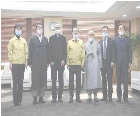
▲[Feb.24] Meeting with religious leaders from major 5 religions to stop the spread of COVID-19